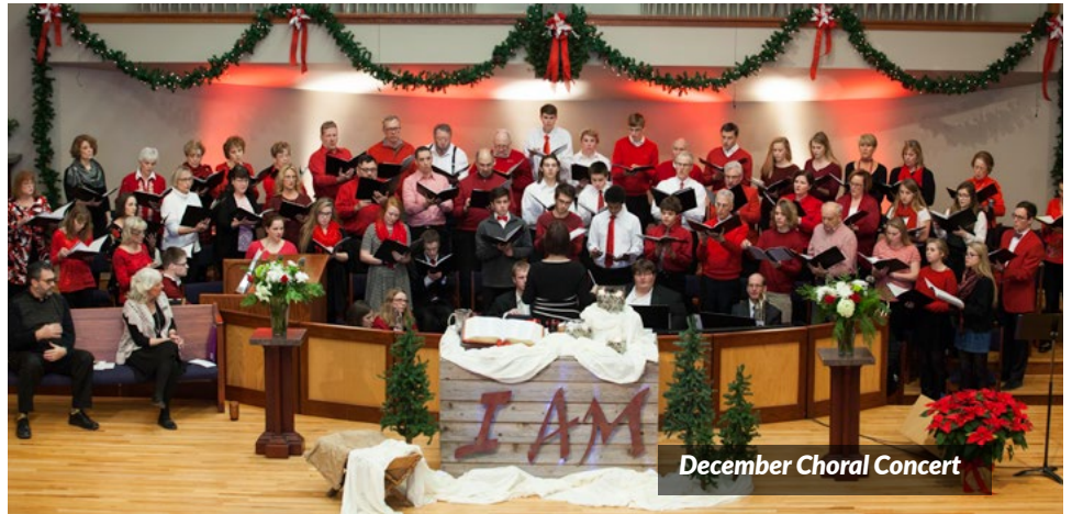
December Choral Concert

The adult Chancel Choir sings selections from the Classical Choral Repertoire weekly in worship. Regular rehearsals are Wednesdays, 7:30-8:45 PM.