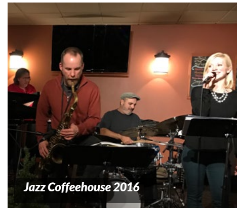
Jazz Coffeehouse 2016