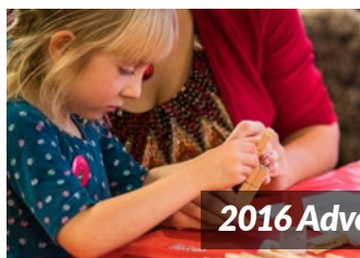
2016 Advent Workshop

Parents—we will no longer offer diaper changing while your little one is in the Nursery. Please be sure to leave your cell number when you sign in so that we can contact you for diaper duty! Thanks!