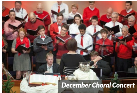
December Choral Concert