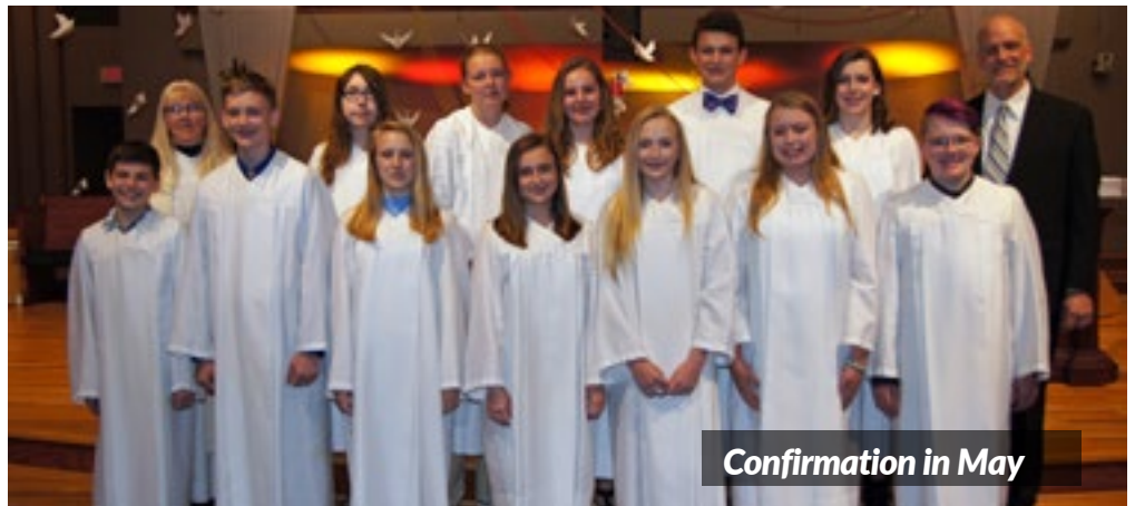
Confirmation in May

COYO Jr High meets during the school year on Sunday afternoons from 4:30 PM to 6:30 PM, including dinner at 6 PM. The purpose is to build strong and welcoming friendships, serve the community together, and grow in faith.