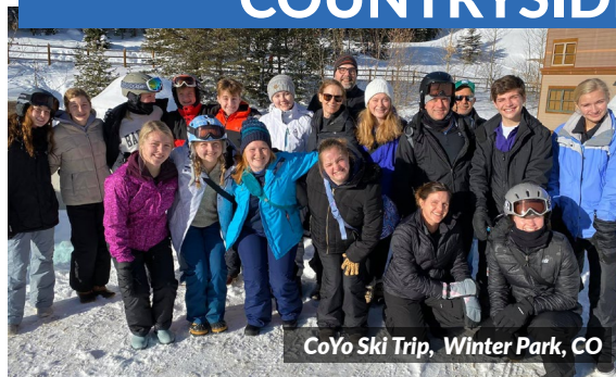
CoYo Ski Trip, Winter Park, CO