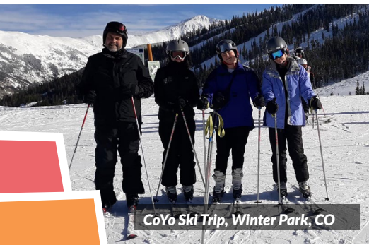
CoYo Ski Trip, Winter Park, CO