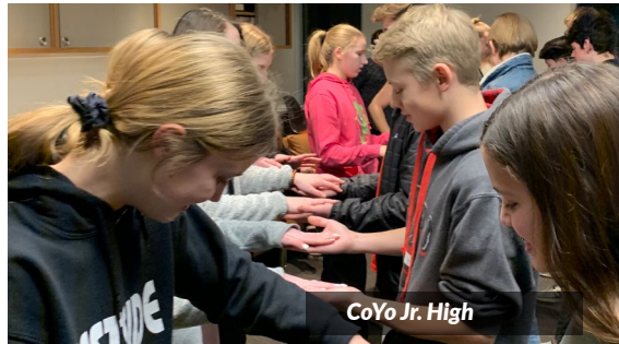
CoYo Jr. High