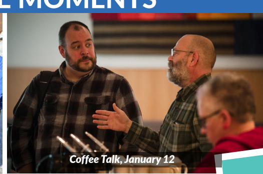
Coffee Talk, January 12