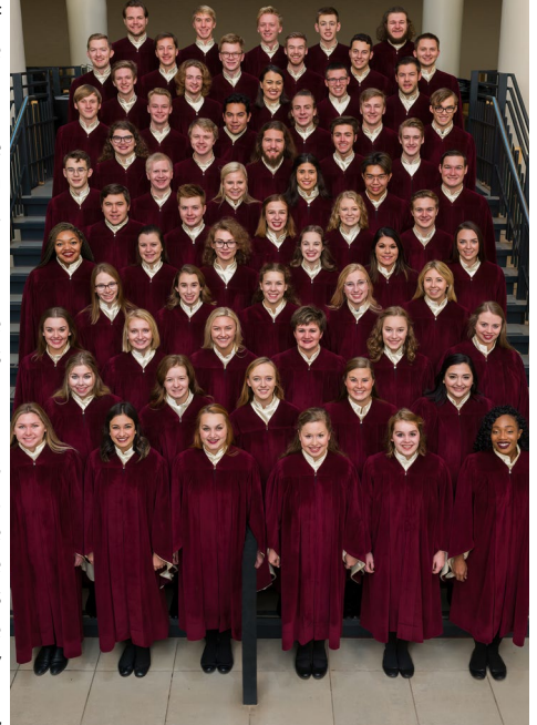
The Gustavus Choir from Gustavus Adolphus College in Saint Peter, Minnesota

Located in Saint Peter, Minnesota, Gustavus Adolphus College is a private, coeducational, liberal arts college affiliated with the Evangelical Lutheran Church in America. More than one-third of all Gustavus students participate in the music program, with three choirs, three wind ensembles, two symphony orchestras, three jazz ensembles, and numerous chamber ensembles that total over 30 musical ensembles on campus.