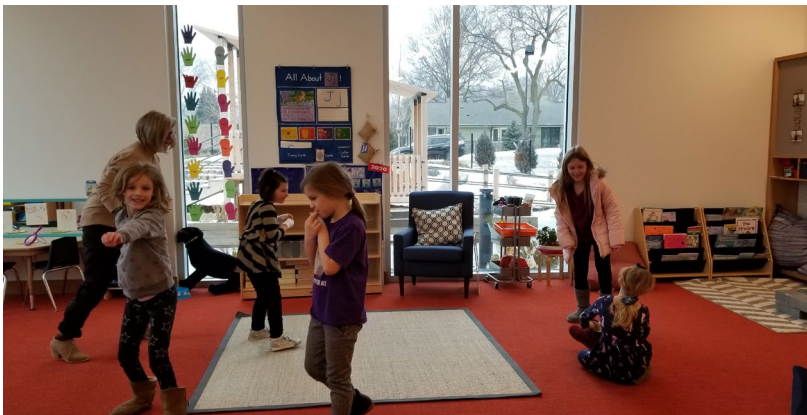
Second and third grade Sunday School.

Remember that our Countryside programming follows the weather cancellations of the Omaha Public School District.