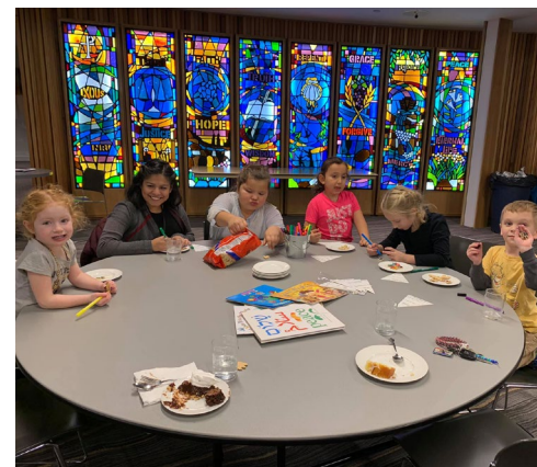
A view of the rock glass windows in Marys' Hall during the Advent Brunch in December.

8. The Lily – Eternal Life - Symbolizing Easter, and our rebirth in the Spirit.