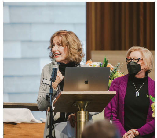
Annual Meeting on February 13