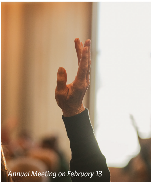
Annual Meeting on February 13