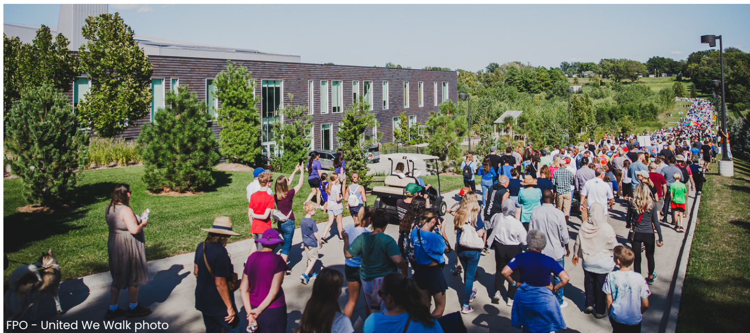
FPO - United We Walk photo

YOU ARE AMAZING. IMPORTANT. SPECIAL. UNIQUE. YOU ARE KIND. SMART. LOVED.