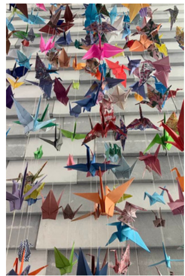
It takes a village to create a display of 1,000 cranes. Our thanks to all who helped make Peace Sunday so moving!