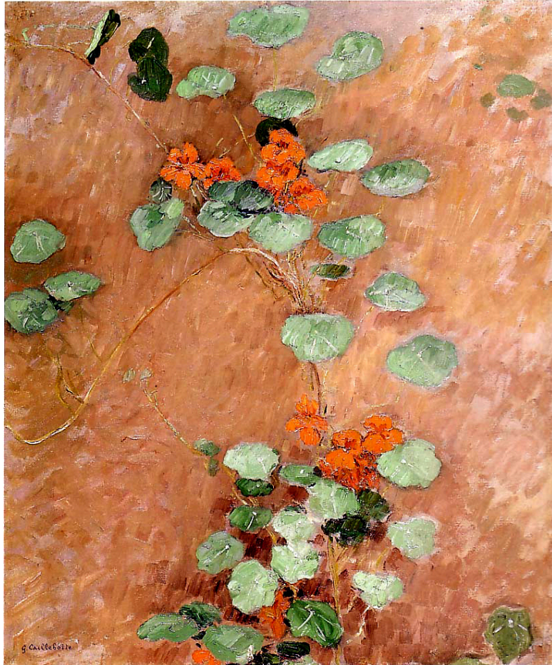
Nasturces , Gustave Caillebotte, 1892