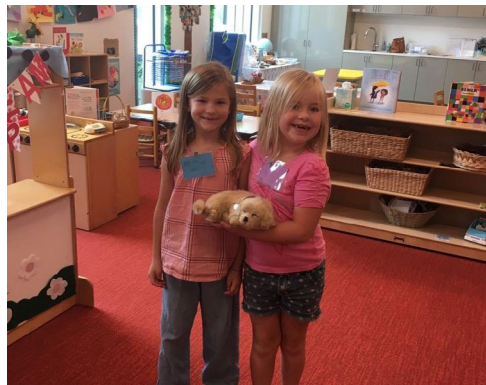
Sunday school students with class altar and playing with stuffed animals.