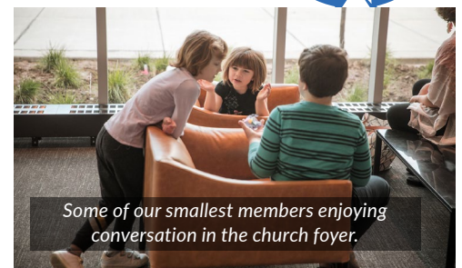
Some of our smallest members enjoying conversation in the church foyer.

Today, members from more than 40 different faith backgrounds have been called to join our community, allowing us to fully embody the meaning of the Greek word, ecumenical, meaning "the whole household of God."