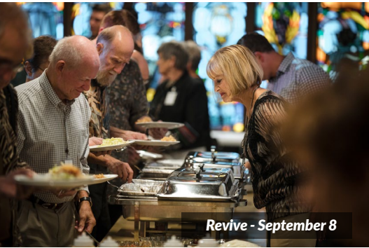
Revive - September 8