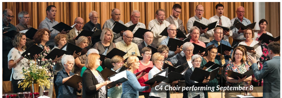
C4 Choir performing September 8

Please join us in worship on October 20 to hear C4 perform Ariel Ramirez's Misa Criolla. Ramirez was an Argentine composer who composed the work shortly after Vatican II, writing in the vernacular both verbally (Spanish) and musically (using indigenous folk idioms). The service will feature an ensemble playing on Latin-American instruments and we will have a brief talk-back after both services to explain more about the music and take questions from the congregation.