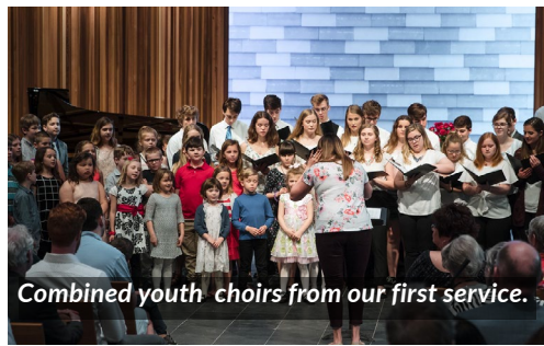
Combined youth choirs from our first service.