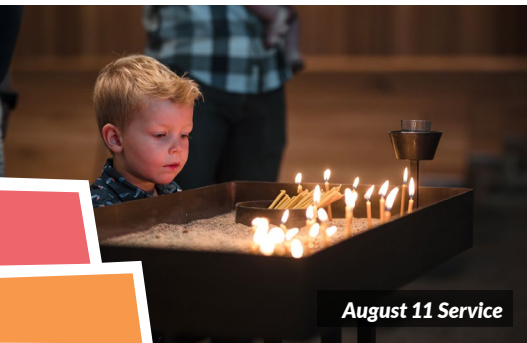
August 11 Service