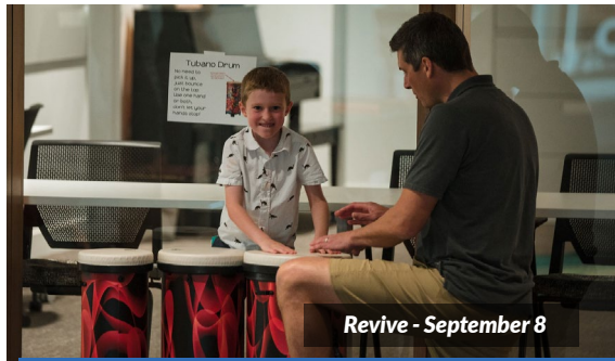
Revive - September 8