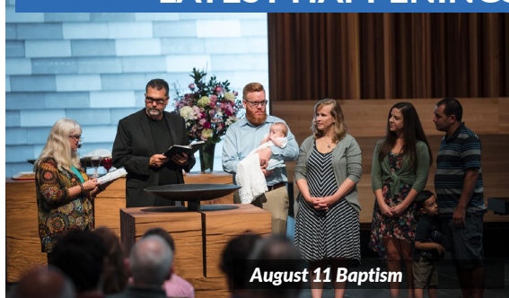
August 11 Baptism