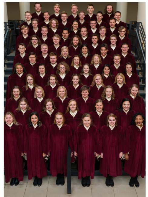
The Gustavus Choir from Gustavus Adolphus College in Saint Peter, Minnesota

Located in Saint Peter, Minnesota, Gustavus Adolphus College is a private, coeducational, liberal arts college affiliated with the Evangelical Lutheran Church in America. More than one-third of all Gustavus students participate in the music program, with three choirs, three wind ensembles, two symphony orchestras, three jazz ensembles, and numerous chamber ensembles that total over 30 musical ensembles on campus.