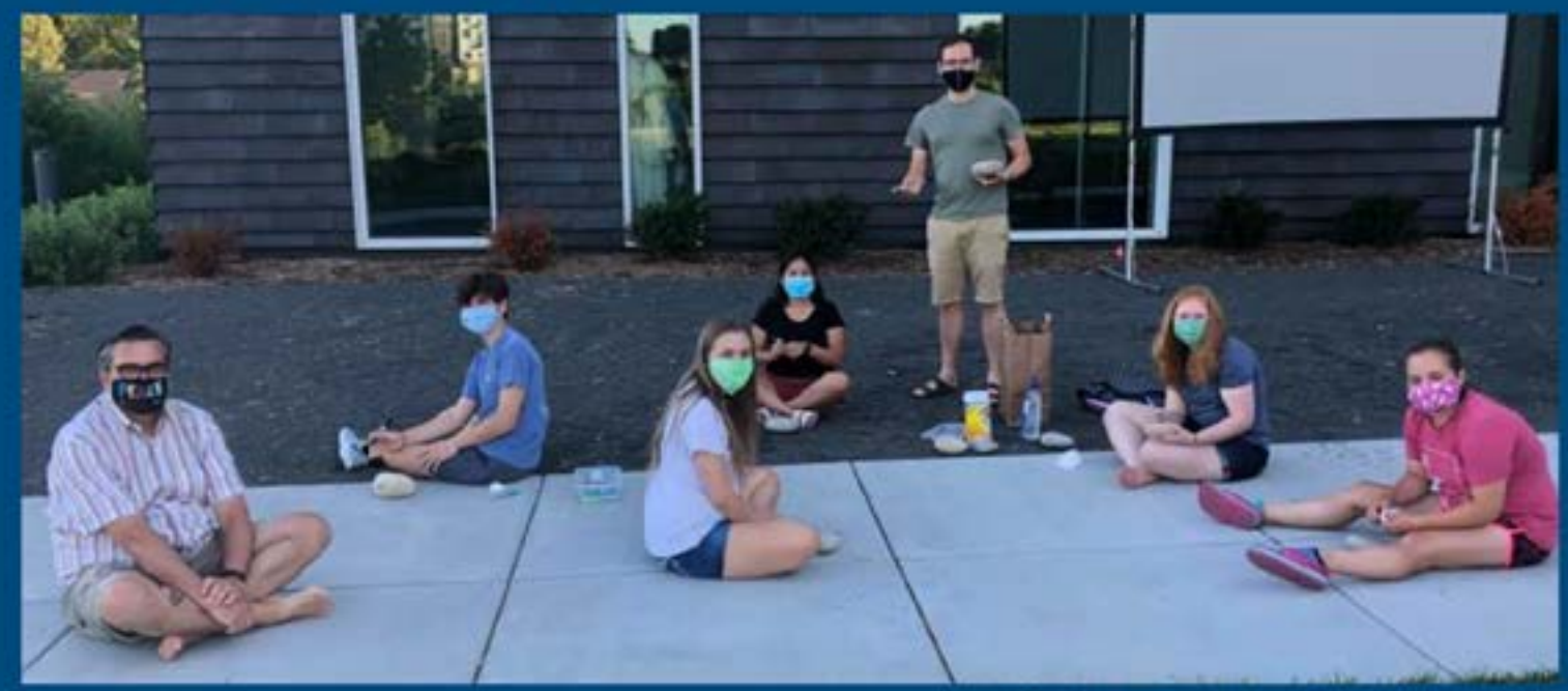
COYO Sr. High socially distanced Senior Night on July 27.