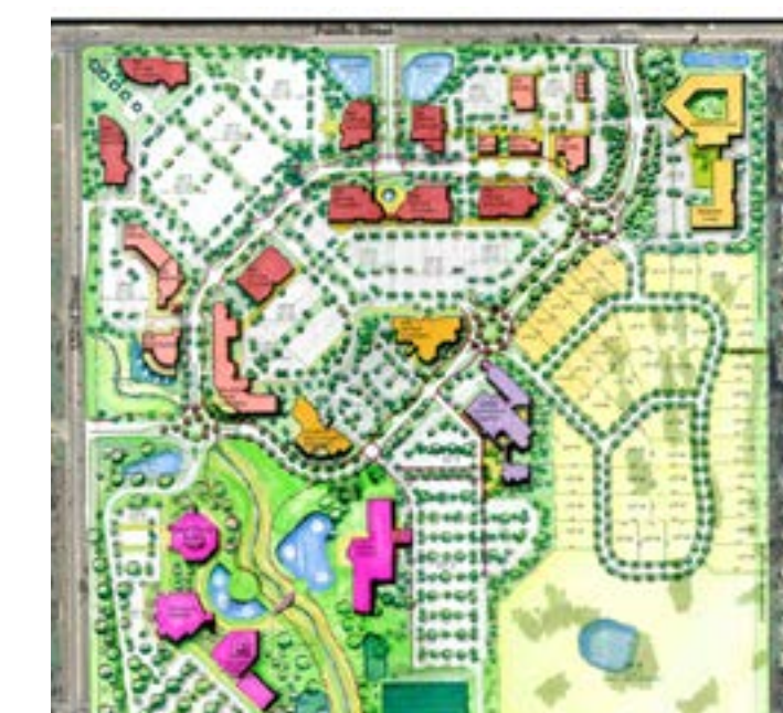
One of the first editions of the Sterling Ridge plats from 2011.