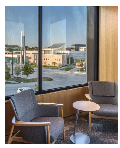
The Tri-Faith Center's Reflection Room offers a quiet space of contemplation, along with views of Countryside Community Church, Congregation of Temple Israel, and American Muslim Institute - AMI.