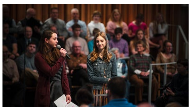
Last in-person service, March 2020

"For the entire law is fulfilled in keeping this one command: "Love your neighbor as yourself." ~Galations 5:14