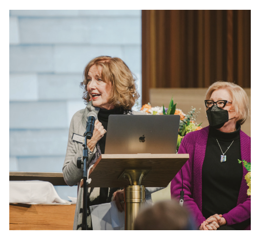
Annual Meeting on February 13