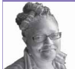
Dean of Vanderbilt Divinity School

The Center for Faith Studies provides learning opportunities for the faithfully inquisitive Countryside Community. We encourage lifelong learning, growth and deepening understanding utilizing current scholarship through the CFS community lecture series, Wednesday Night Alive events, adult education classes and community partnerships.