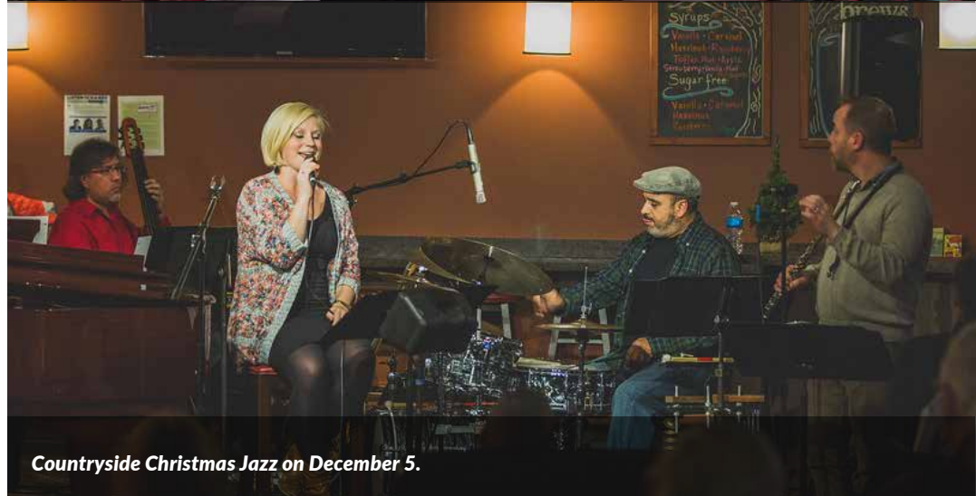
Countryside Christmas Jazz on December 5.