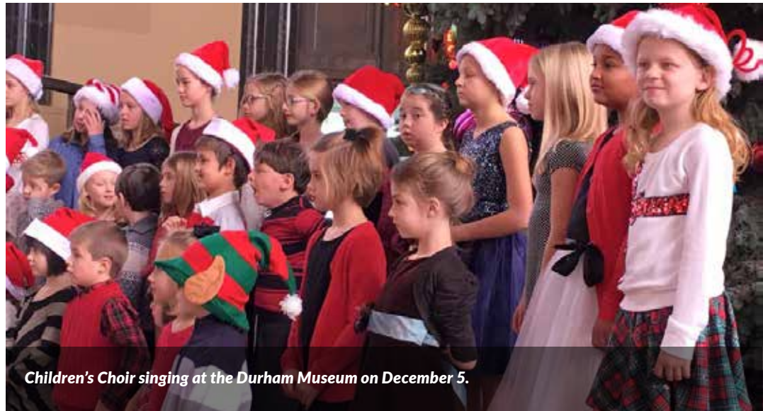
Children’s Choir singing at the Durham Museum on December 5.

Spirit of Grace is a group of adults of all ages that explore contemporary church music. This group rehearses on Wednesdays from 8:05-9:05 p.m. Spirit of Grace generally sings once or twice each month, alternating between the first and second services.