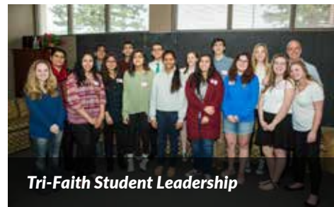
Tri-Faith Student Leadership

COYO Jr High meets Sunday afternoons from 4:30 PM to 6:30 PM, including dinner at 6 PM. The purpose is to build strong and welcoming friendships, serve the community together, and grow in faith.