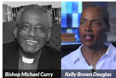
Bishop Michael Curry