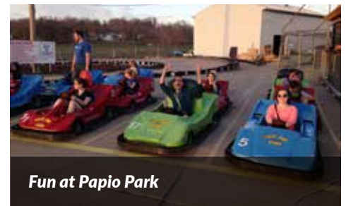
Fun at Papio Park