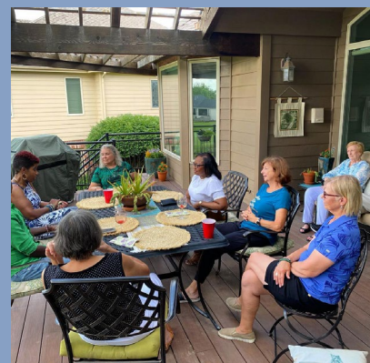
Pastoral care breakfast.

The Board of Christian Outreach thanks you in advance, for your generosity.