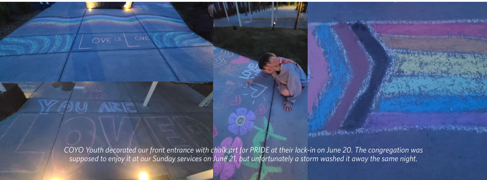
COYO Youth decorated our front entrance with chalk art for PRIDE at their lock-in on June 20. The congregation was supposed to enjoy it at our Sunday services on June 21, but unfortunately a storm washed it away the same night.

NON-PROFIT ORG. U.S. POSTAGE PAID Omaha, Nebraska Permit No. 106