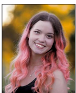
Mallis Bonner Board of Youth / shared