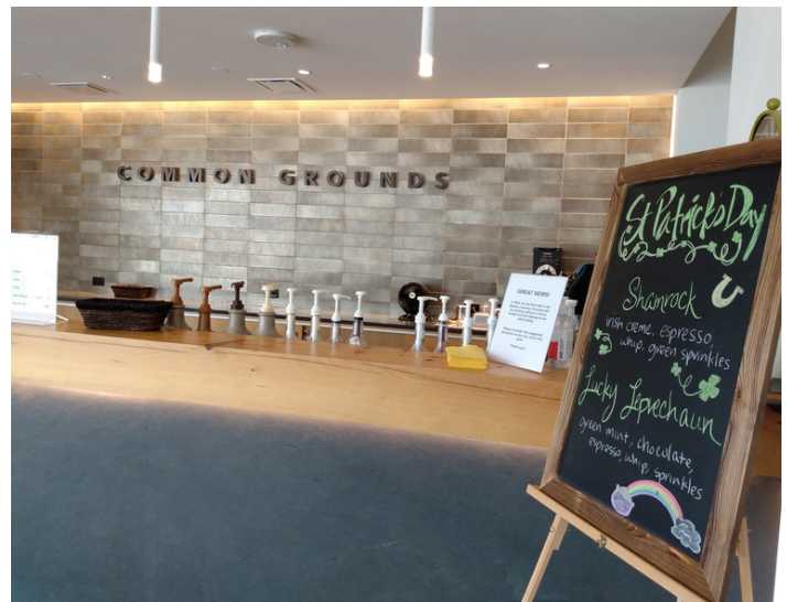
The Tuesdays trial run may open the coffee house for more, set open hours.