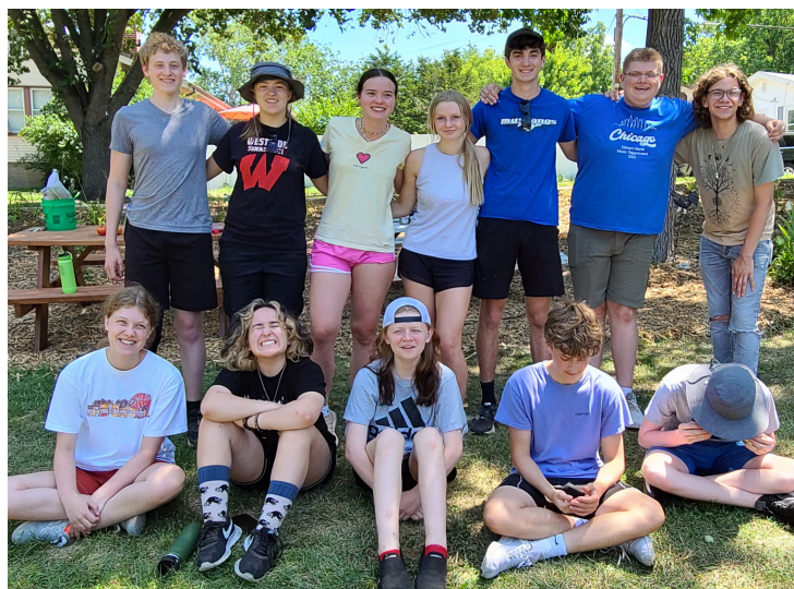
Members of the 2022 Youth Service Trip to St. Louis