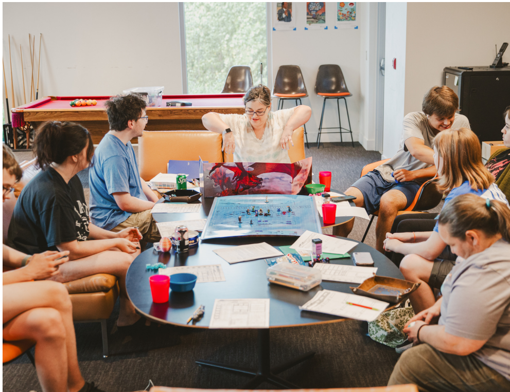
Above: Emotional Damage D&D Campaign Group. At right: Wednesday Wonderers fun!