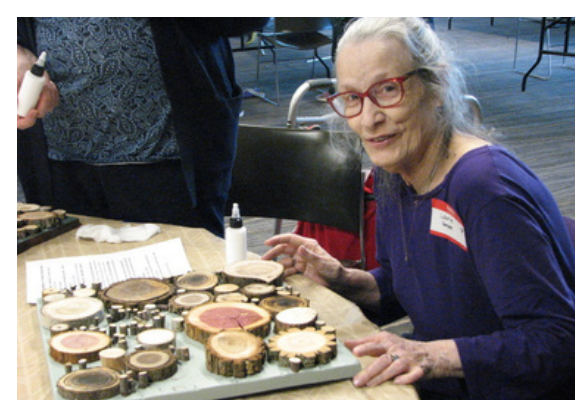
A true intergenerational project, Blessings of the Earth brought together the youngest and most senior members of Countryside to create the stunning installation in the Narthex.