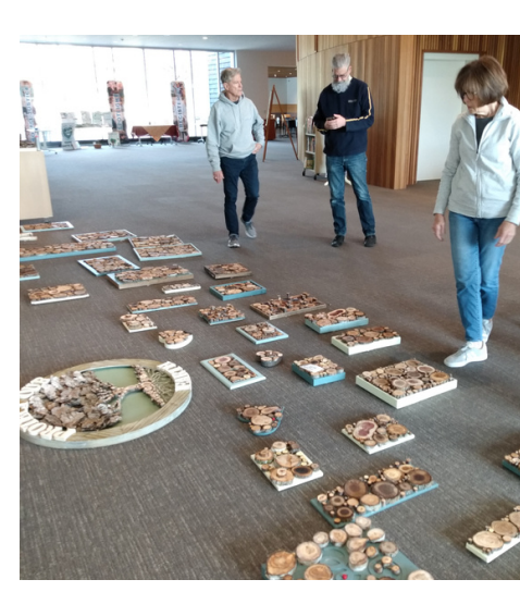
Blessings of the Earth took thousands of wood 'cookies' and a full contingent of artists and volunteers to complete. The installation took place on Friday, April 19.