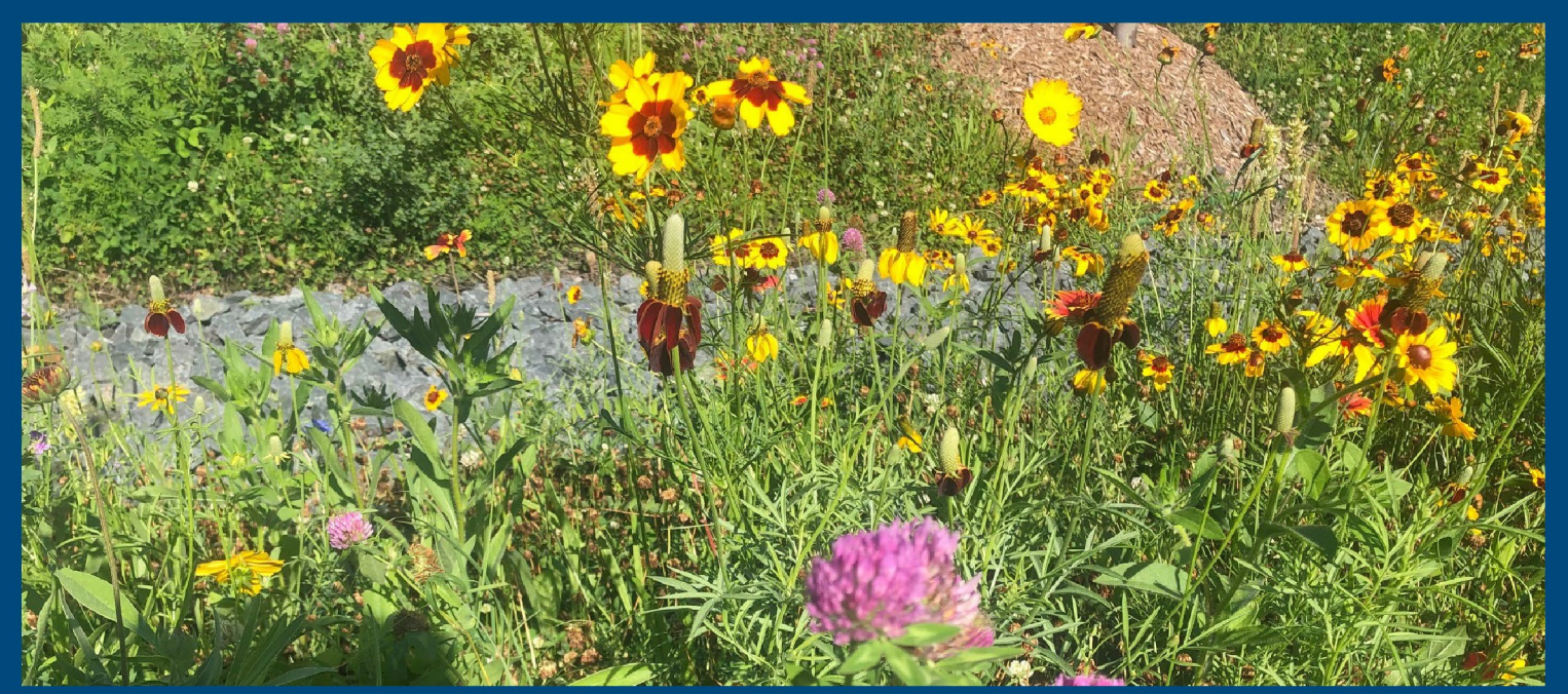
Enjoy the native plants blooming around Countryside, page 4.