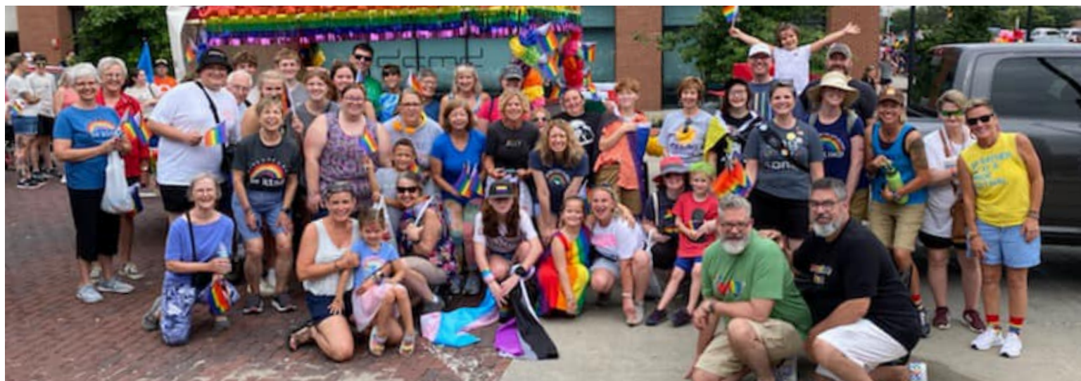
Some of our Countryside family at Pride last summer!

The PRIDE Special Section of Countryside Currents