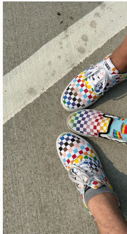
Tig Notaro, Adore Delano, Amanda Lepore and Princess Nokia are scheduled to appear at this year's Heartland PRIDE Festival.