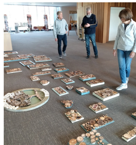
Blessings of the Earth took thousands of wood 'cookies' and a full contingent of artists and volunteers to complete. The installation took place on Friday, April 19.