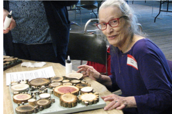
A true intergenerational project, Blessings of the Earth brought together the youngest and most senior members of Countryside to create the stunning installation in the Narthex.