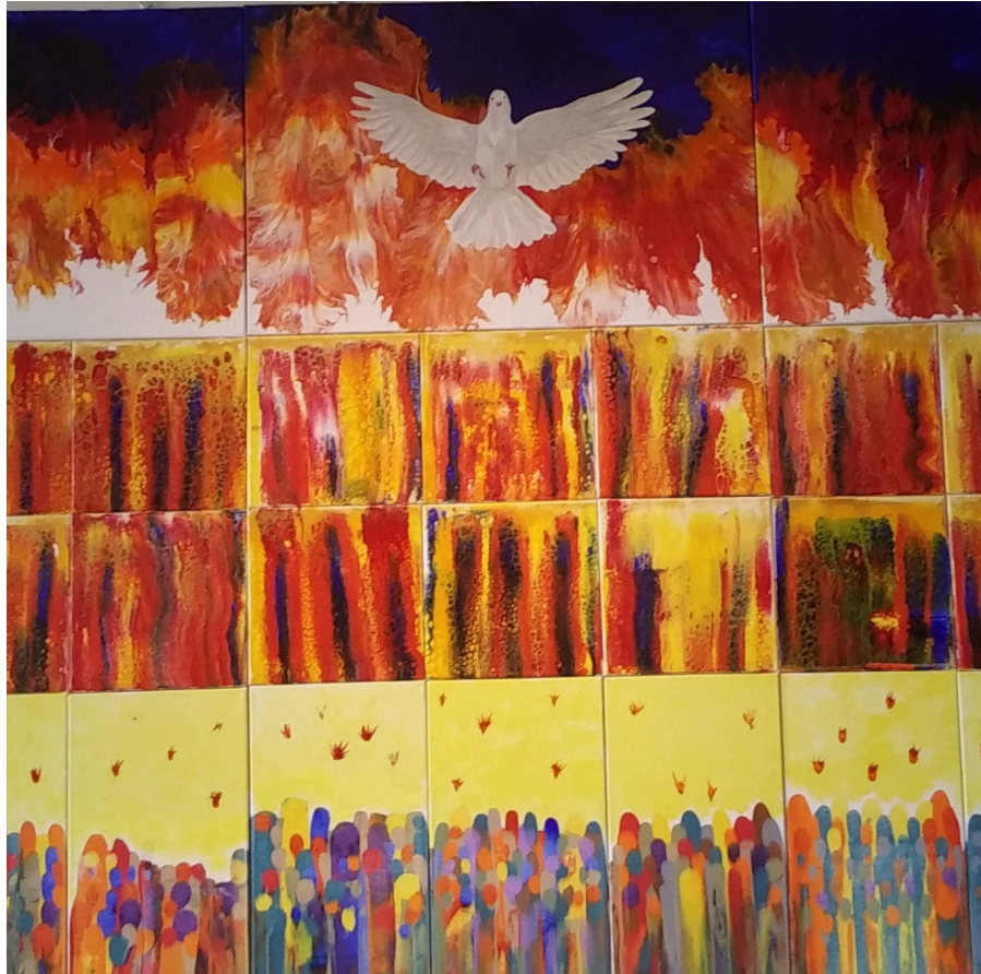
The Gifts of Pentecost, Countryside Intergenerational Artists, 2023