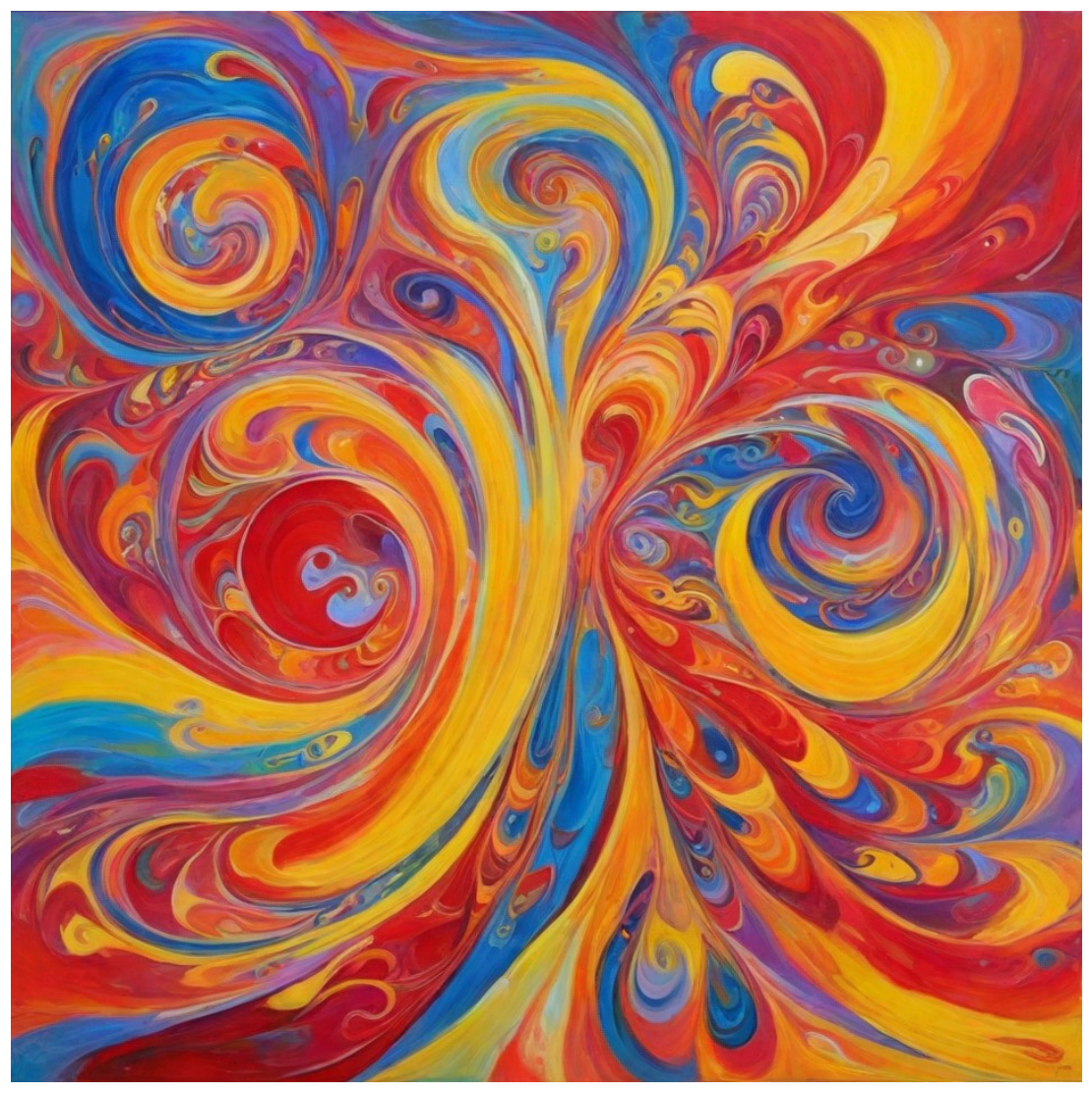
Swirling Diversity, virtual graphic, Countryside creative collaboration with DALL-E 3 Al, May 20, 2024