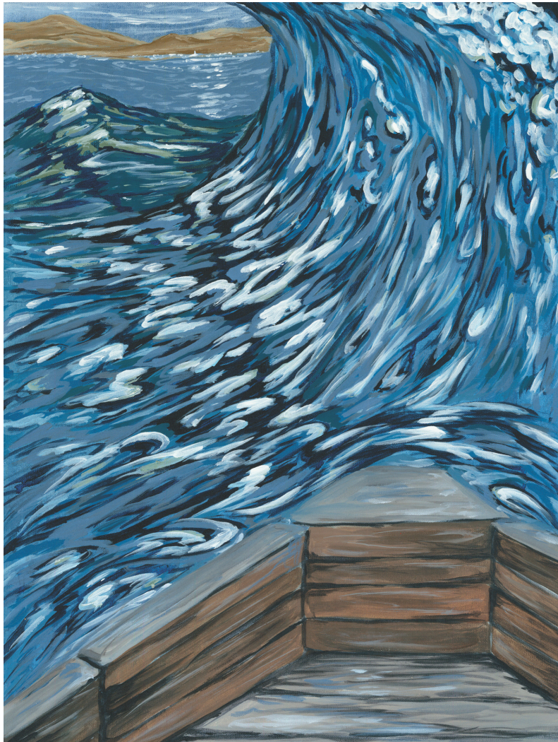
Into the Swell / Acrylic on canvas / Lisle Gwynn Garrity / sanctifiedart.org