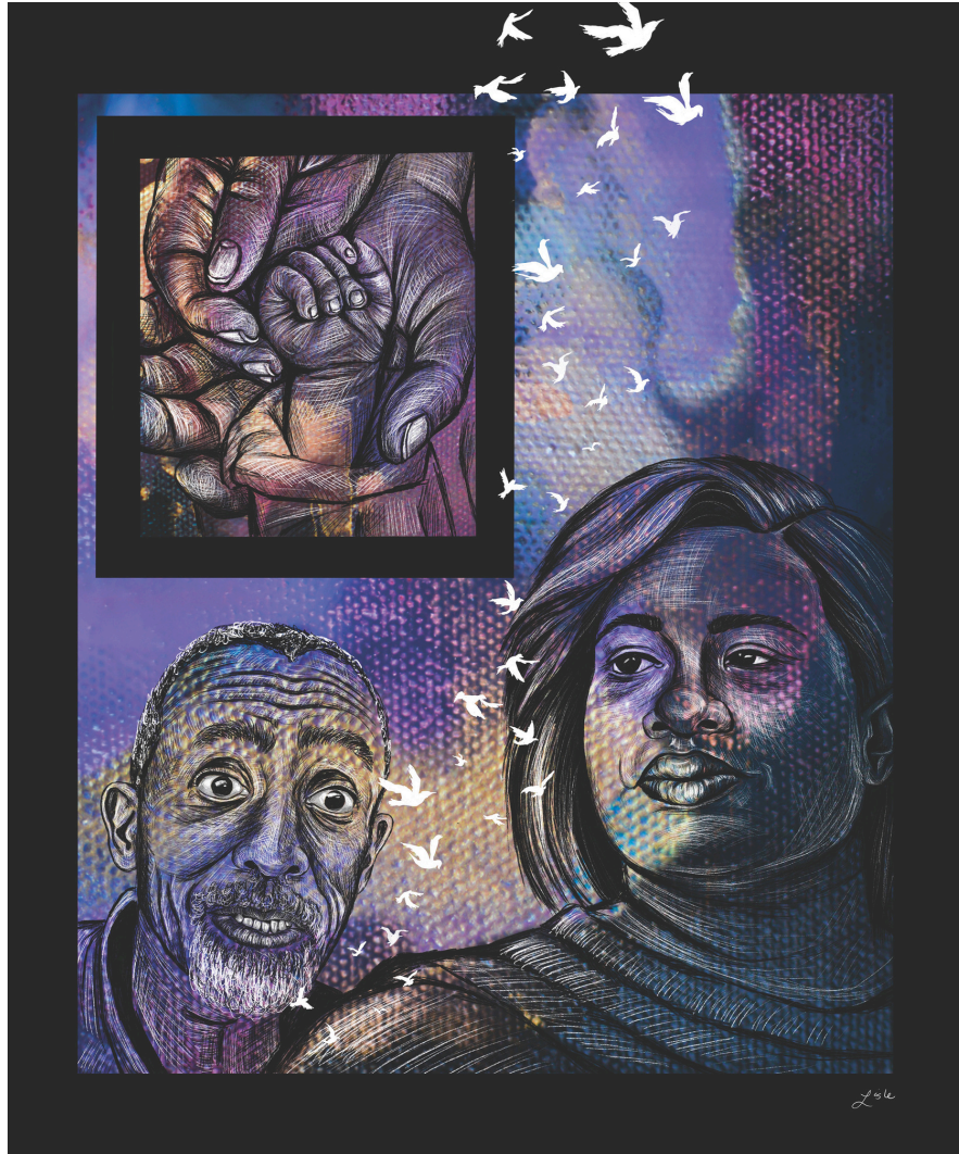
Revelation by Lisle Gwynn Garrity ~ Acrylic painting on canvas with digital drawing ~ sanctifiedarts.com