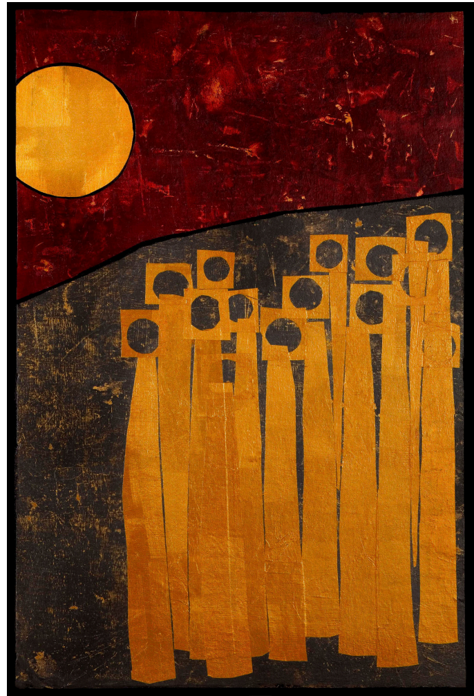
A Gathering of Spirits